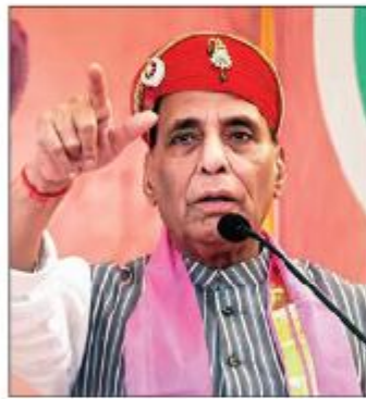
Rajnath Singh addresses a public meeting in Nathdwara, Rajasthan, on Friday

"The cricket world cup is going on in India. And the condition of Congress in Rajasthan is also like that of the Pakistan cricket team. In the run up to the elections, like Pakistan, Congress seems to be